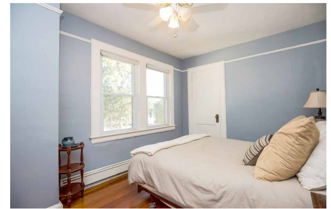
BEAUTIFULLY FINISHED ACROSS FOUR LEVELS